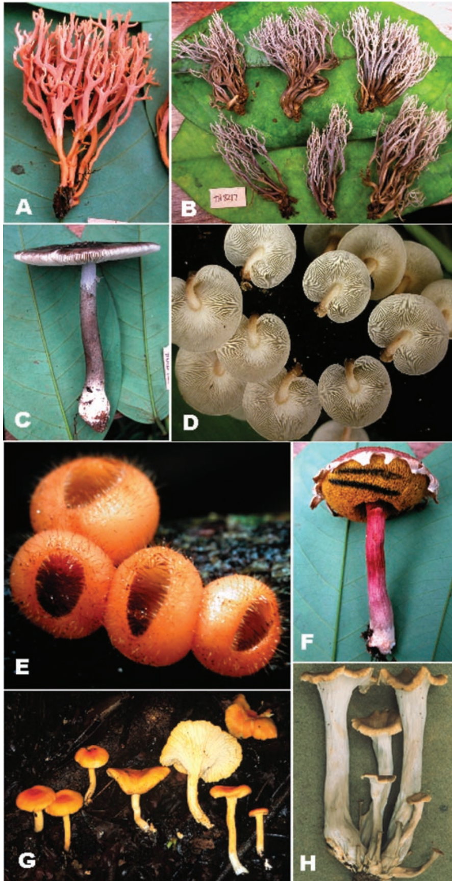
Fig 4 Edible mushrooms of the Pakaraima Mountains. a. Clavulina sp. 1, "kunmudlutse" b. Clavulina sp. 2., "tepurumeng" c. Amanita perphaea , "pulutukwe" d. Lentinula cf. boryana , "kapiokwok" e. Ascomata of Cookeina sp., "agubana" f. Boletellus ananas g. Cantharellus guyanensis h. Craterellus sp. 1