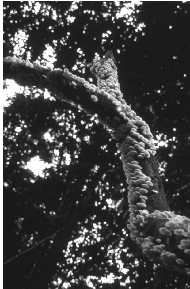
Fig 3 Fruiting habit, Lentinula cf. boryana , "kapiokwok".

A second method of cooking involves the simple addition of edible mushrooms to the family 'pepperpot'. The traditional Amerindian pepperpot, called 'tuma' by the Patamona, is a cooking pot kept perpetually warm on the household hearth, into which the daily catch of wild meat, fish, etc., are added to a salty broth containing liberal doses of very hot peppers ( Capsicum spp.). In our case, recently collected mushrooms were added directly to the pepperpot, boiled, and consumed with cassava bread ( Manihot esculenta ). All mushrooms consumed by the Patamona may be prepared in this manner except for Lentinula cf. boryana ('kapiokwok')